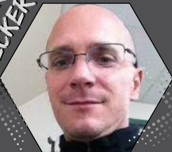
On-Ice Instructor Skills Coach of Core Hockey - Owner