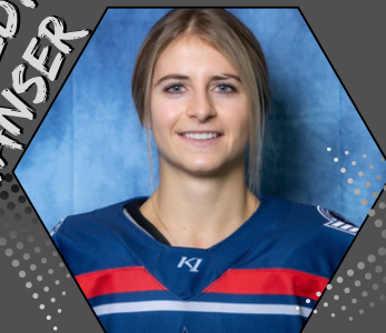
On-Ice Instructor UofA Golden Bears Womens Hockey