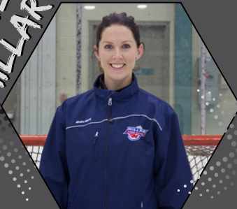
On-Ice Instructor Master Power Skating Instructor