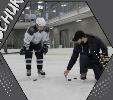
Lead On-Ice Instructor

Former WHL player of 4 years. Former captain of the Grant MacEwan Men's University hockey team. Participated in Memorial Cup and ACAC all star team. Awarded top scorer and Molson Cup Three Star award during time with the Regina Pats and Saskatoon Blades. Coached UofA Golden Bears, winning National CIS Championship. 12 years of running hockey camps across Alberta as the founder and lead skills coach of Competitive Thread.