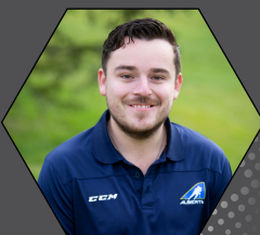
Academy Lead Teachers