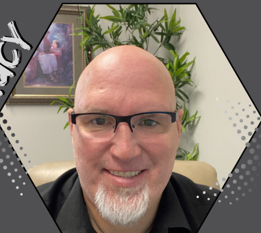
Academy Administrator / Principal

Seasoned school administrator with EICS for 26 years. Former CFL pro-athlete (Retired - Edmonton Eskimos and Winnipeg Blue Bombers). Former basketball, baseball and university football coach.