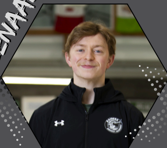
On-Ice Instructor UofA Golden Bears Assistant Coach