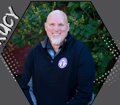
Academy Administrator / Principal

Seasoned school administrator with EICS for 27 years. Former CFL pro-athlete (Retired - Edmonton Eskimos and Winnipeg Blue Bombers). Former basketball, baseball and university football coach.