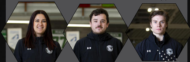
Holy Redeemer Academy - Lead Teachers