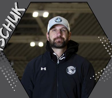
Lead On-Ice Instructor

Former WHL player of 4 years. Former captain of the Grant MacEwan Men's University hockey team. Participated in Memorial Cup and ACAC all star team. Awarded top scorer and Molson Cup Three Star award during time with the Regina Pats and Saskatoon Blades. Coached UofA Golden Bears, winning National CIS Championship. 12 years of running hockey camps across Alberta as the founder and lead skills coach of Competitive Thread.